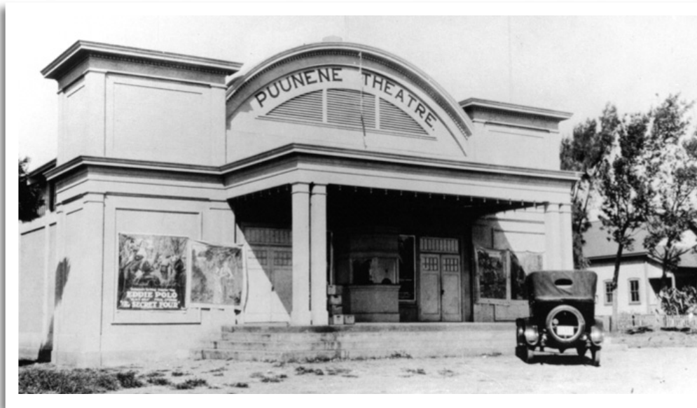
Old Pu'unenē Theatre Ca. 1923