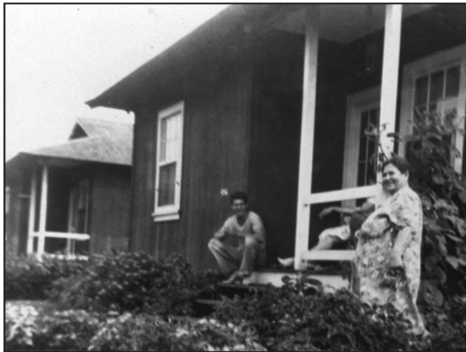
Portuguese Family in "Spanish B" Camp, HC&S Plantation, Pu'unēnē, 1930's