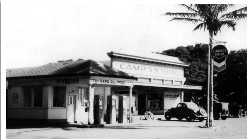
Camp 5 Store, Pu'unenē Ca. 1940