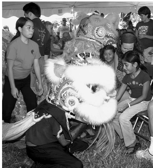
"Feeding" the Chinese Lion never fails to excite and entertain. A lot of good fortune was dispensed that day, courtesy of the Maui Chinese Martial Arts Academy lion dancers.