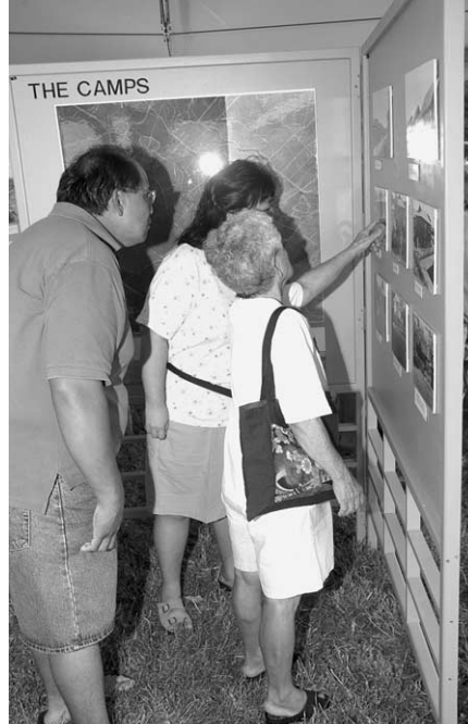
Residents recognize some of their old haunts in-and-around the plantation camps in days gone by.