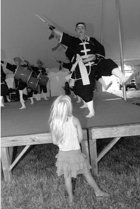
A person can experience other cultures at the Maui Sugar Plantation Festival. Members of Ryukyukoku Matsuri Daiko Hawaii share their Okinawan traditional drum dances.