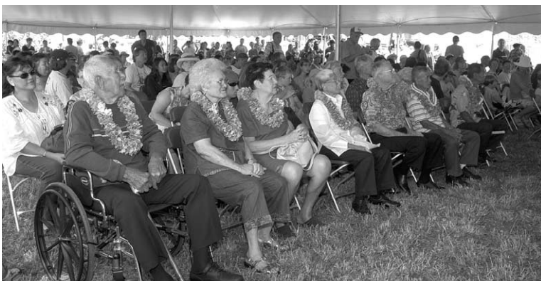
Seven individuals were recognized for their contributions to our sugar plantation heritage.