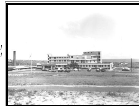
Right: Aerial photo of Maui Memorial Medical Center, formerly called "Central Maui Hospital", 1958.