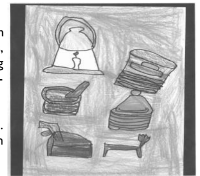
Post field trip artwork by Waihee second grade students.

For more information, or if you know a teacher or educator who might be interested in this program, they can contact the Coordinators through the museum via email, sugarmus@maui.net ; by phone, 808-871-8058; or fax, 808-871-4321.