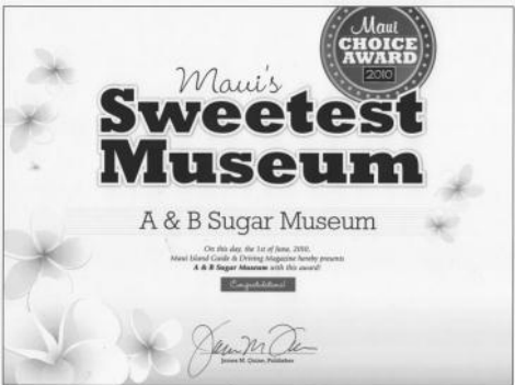
Alexander & Baldwin Sugar Museum has the distinction of being voted "Maui's Sweetest Museum".