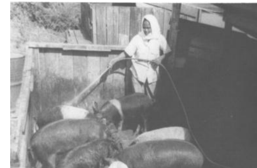
Pig Pen, Kaheka, 1950's.

If you would like to record your family's plantation camp history, please call 808-871-8058.