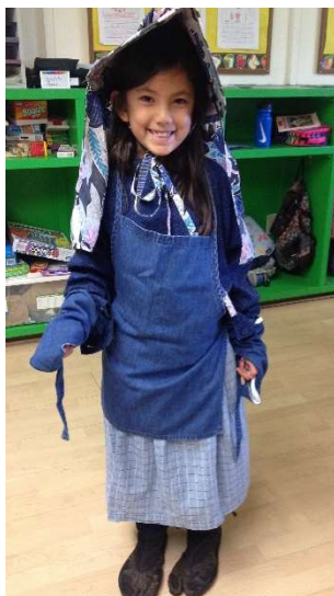
A second grader poses for picture after dressing up in a field worker's clothes.