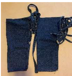
Kyahan (Knee to Ankle Wrapping)