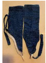
Te oi (Arm Covering)